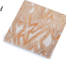
MOKUME-GANE JAZZ 925/-SILVER/COPPER, DIFFERENT LAYERS Standard thickness: 0,52 mm Overall width: 76 mm Cust. spec. sizes: 300 mm Order no. 38474