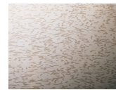
SPRINKLED 500/-PALLADIUM/935/-SILVER continuous bicolor Sprinkled Order no. 6322

Standard thickness: 1 mm Overall width: 65 mm Customer specific sizes: 0,50 - 0,99 mm