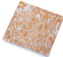
MOKUME-GANE RANDOM 925/-SILVER/ COPPER, DIFFERENT LAYERS Standard thickness: 0,52 mm Overall width: 76 mm Cust. spec. sizes: 300 mm Order no. 38476