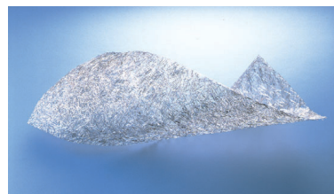
FIBRE MAT 750/-YELLOW GOLD Size: approx. 150 x 100 mm Weight: approx. 45 g Order no. 26067

COLLECTION: LIGHT METAL C. HAFNER fibre mats are a new form of semi-finished products. Their shape and low weight allow jewellery of new visual appeal to be created.