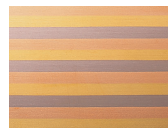
750/- STRIP GOLD, CONTINUOUS TRICOLOUR (yellow/white/red) Colour strip width: 1 mm Order no. 6313

Alloy supplied in a wide range of forms do not only reduce your work load in creating designer jewellery, they also give you new impulse for your creativity.