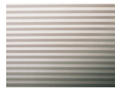
STRIP MAT. 500/-PALLADIUM/935/-SILVER continuous bicolor Colour strip width: 1,5 mm Order no. 6315